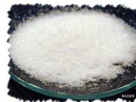
PURE CANE SUGAR IS ONLY ONE EXAMPLE OF THE SUGARS AROUND YOU

Carbohydrate is a fancy way of saying "sugar." Scientists came up with the name because the compounds have many carbon atoms bonded to hydroxide groups. Carbohydrates can be very small or very large molecules, but they are still sugars. What are they used for?