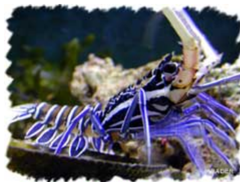
THE CHITIN IN THE SHELLS OF CRUSTACEANS IS A CARBOHYDRATE.

Polysaccharides are also used in the shells of such crustaceans as crabs and lobsters ( chitin ). It is similar in some ways to the structure of cellulose but has a far different use. The shells are solid, protective structures that need to be molted (left behind) when the crustacean needs to grow. It is very inflexible. On the other hand, it is very resistant to damage. While a plant may burn, it takes very high temperatures to hurt the shell of a crab.